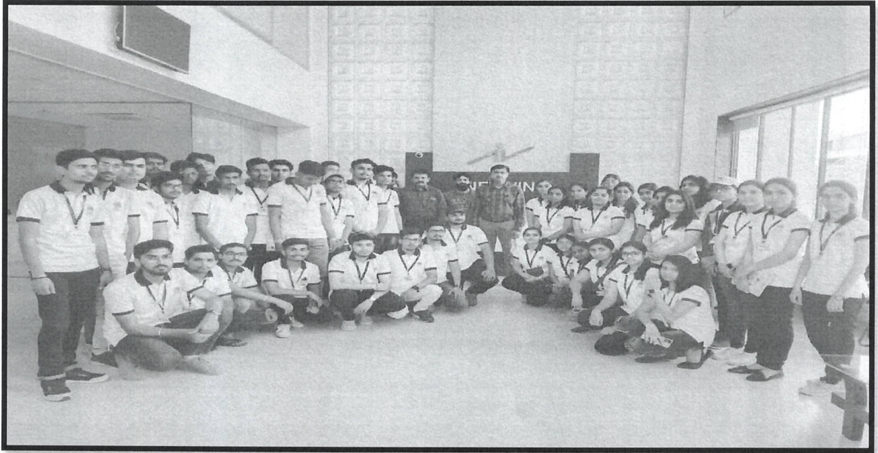
Netwin InfoSolutions Pvt Ltd, Nashik