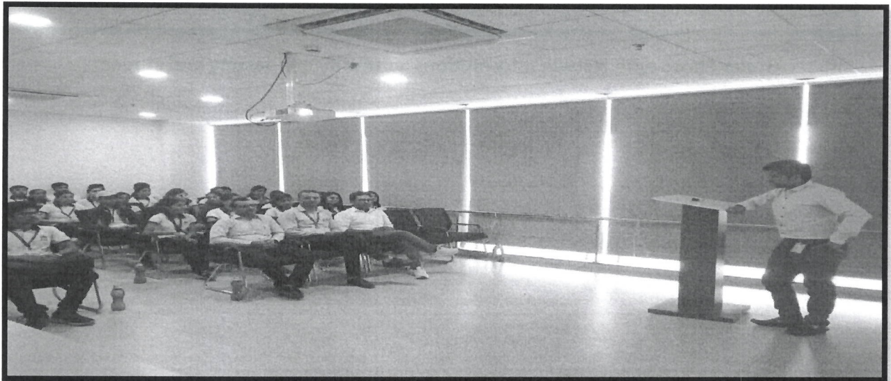
Session conducted at newin infosolutions